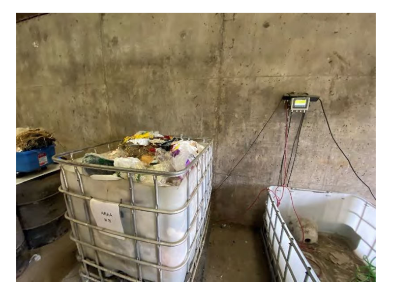
Photo 32: Waste sample from HRM collection Area 8 following sorting. Photo taken August 30, 2022 during waste audit.