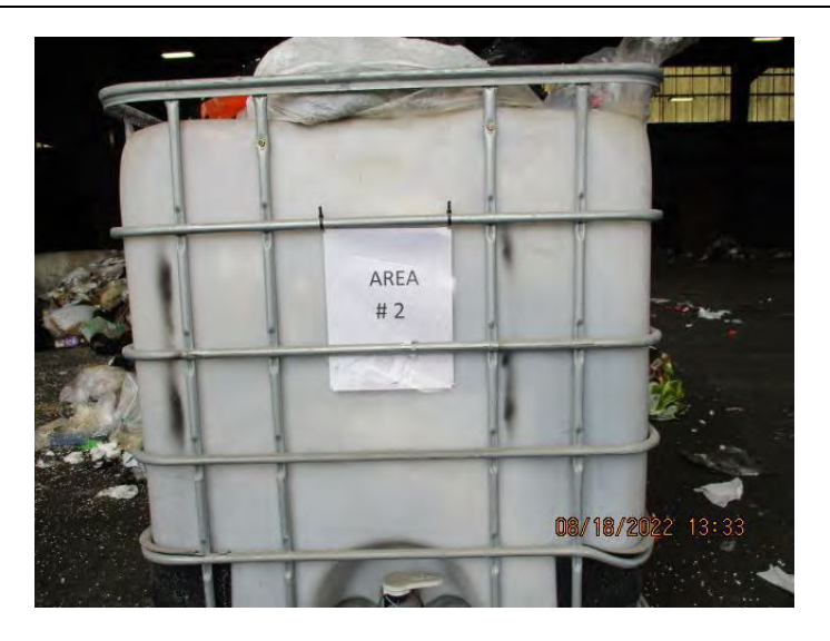
Photo 6: Waste audit sample from HRM collection Area 2. Photo collected August 18, 2022.