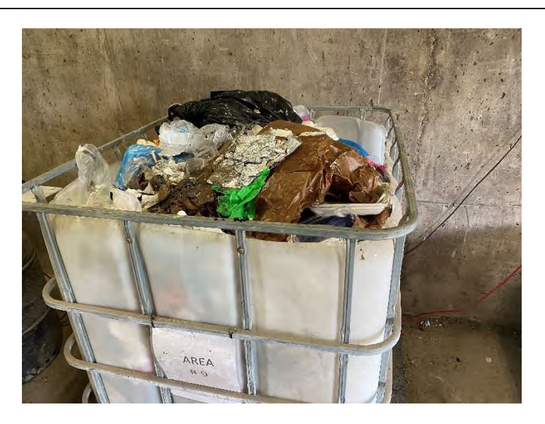
Photo 36: Waste sample from HRM collection Area 9 (Condos) following sorting. Photo taken August 30, 2022 during waste audit.