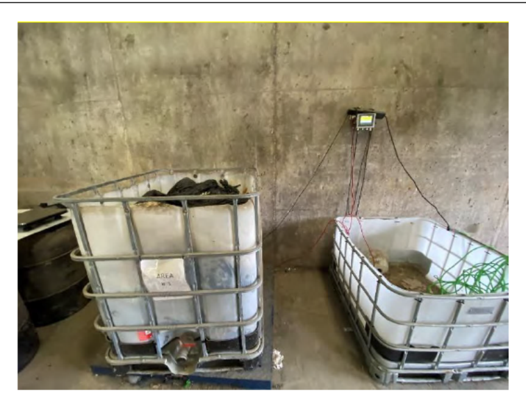
Photo 2: Waste audit sample collected from HRM collection Area 1. Photo taken on August 30, 2022 during waste audit.