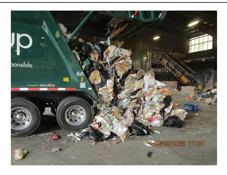
Photo 21: Waste collection vehicle unloading waste collected from HRM collection Area 6. Photo taken on August 23, 2022.