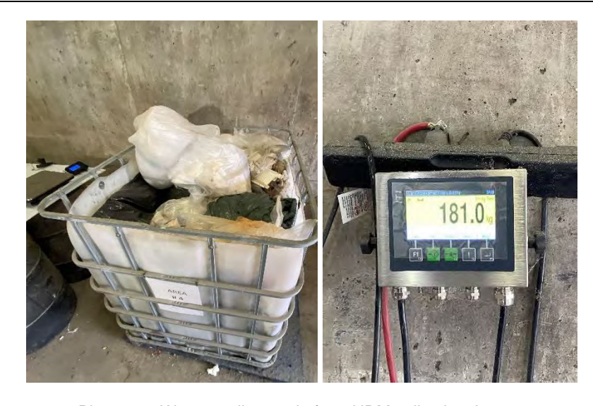
Photo 14: Waste audit sample from HRM collection Area 4. Photo collected August 30, 2022 during waste audit.