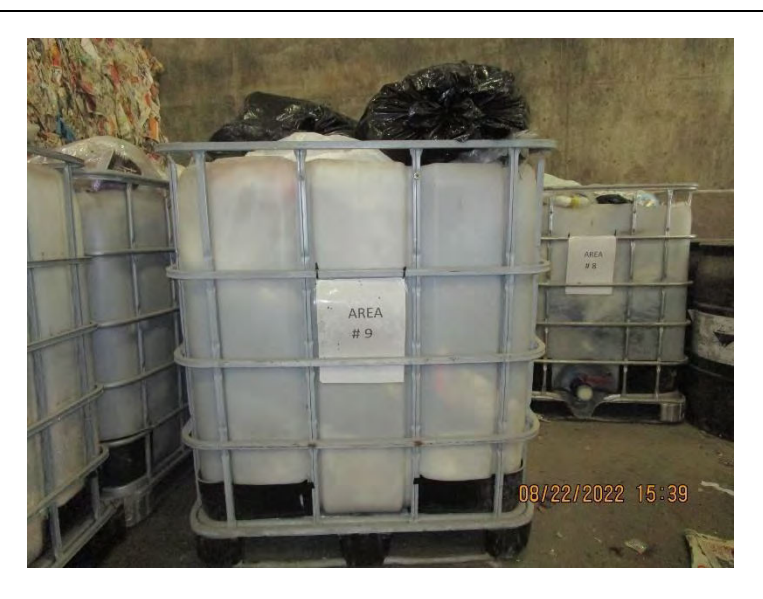
Photo 34: Waste audit sample from HRM collection Area 9 (Condos). Photo collected August 22, 2022.