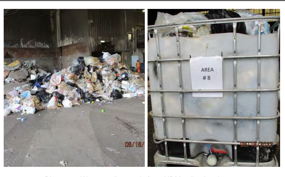
Photo 30: Waste audit sample from HRM collection Area 8. Photo collected August 18, 2022.