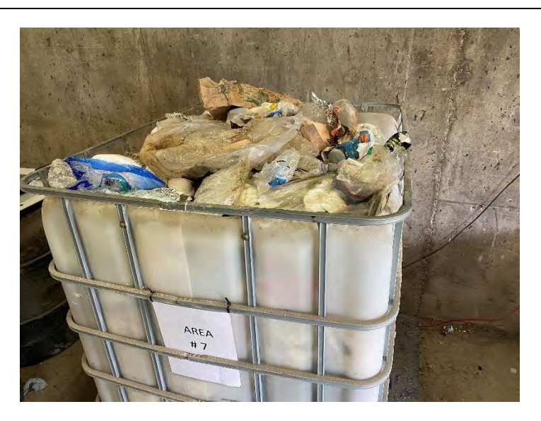
Photo 28: Waste sample from HRM collection Area 7 following sorting. Photo taken August 30, 2022 during waste audit.