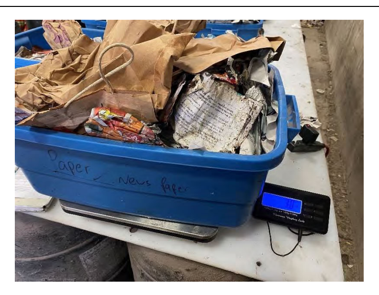
Photo 8: Newsprint/ paper bin sorted from HRM collection Area 2. Photo taken August 30, 2022 during waste audit.