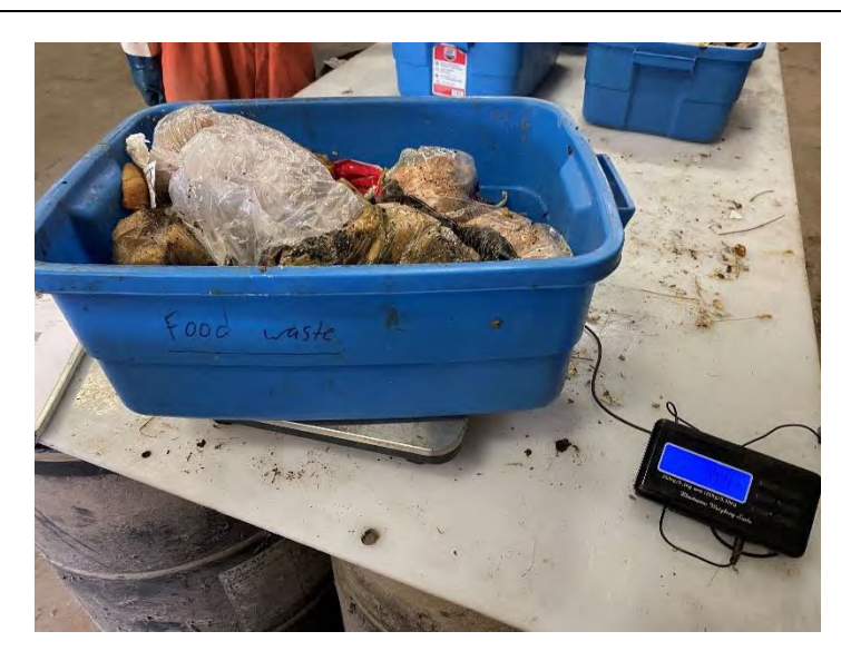
Photo 35: Food waste bin separated from HRM collection Area 9 (Condos). Photo taken August 30, 2022 during waste audit.