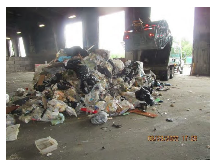
Photo 22: Waste pile from HRM collection Area 6. Photo collected August 23, 2022.