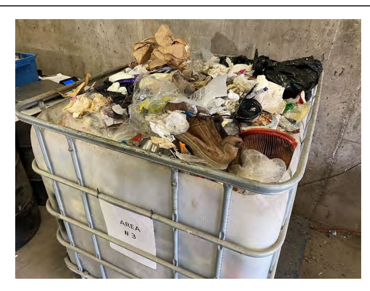
Photo 11: Waste audit sample from HRM collection Area 3 following sorting. Photo collected August 30, 2022 during waste audit.