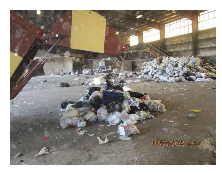
Photo 33: Waste collection vehicle unloading waste collected from HRM collection Area 9 (Condos). Photo taken on August 22, 2022.