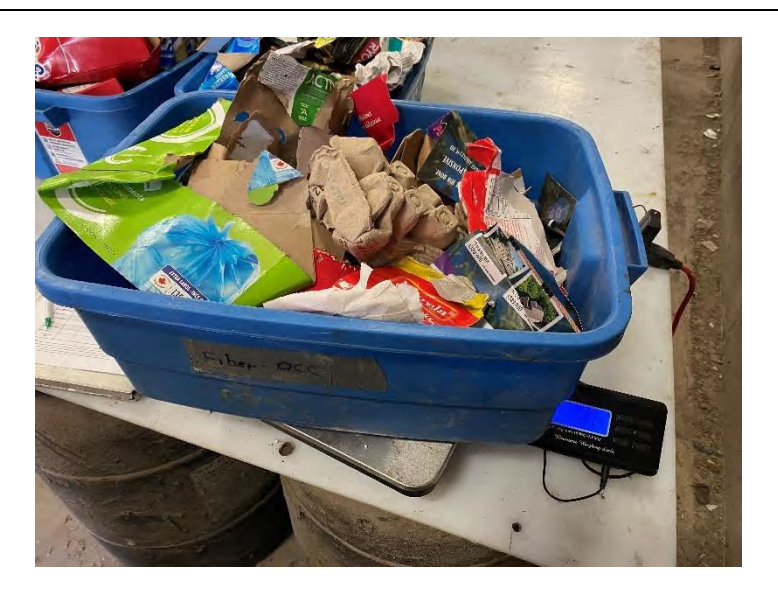
Photo 12: Fiber OCC sorted from HRM collection Area 3. Photo taken August 30, 2022 during waste audit.