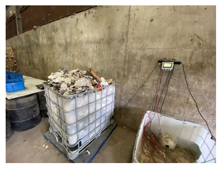
Photo 10: Waste audit sample from HRM collection Area 3. Photo collected August 30, 2022 during waste audit.