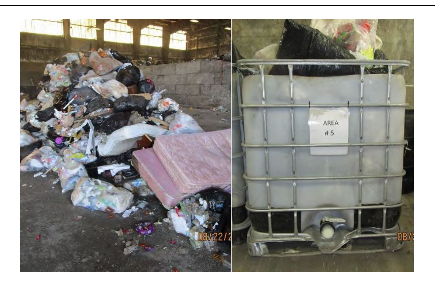
Photo 18: Waste audit sample from HRM collection Area 5. Photo collected August 22, 2022.