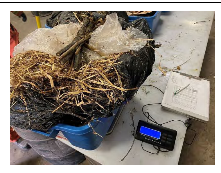
Photo 31: Yard waste bin separated from HRM collection Area 8. Photo taken August 30, 2022 during waste audit.