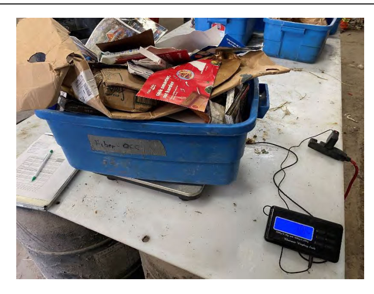
Photo 19: Fiber OCC waste bin separated from HRM collection Area 5. Photo taken August 30, 2022 during waste audit.