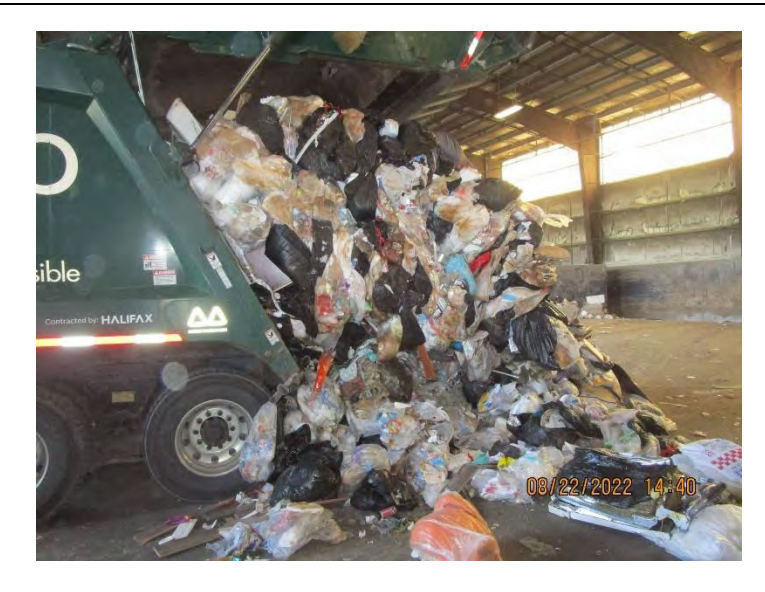
Photo 17: Waste collection vehicle unloading waste collected from HRM collection Area 5. Photo taken on August 22, 2022.