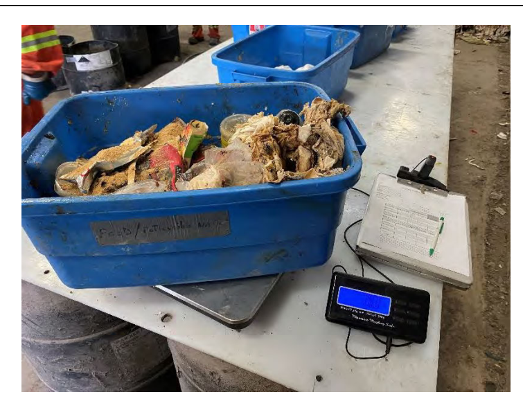
Photo 15: Food waste bin sorted from HRM collection Area 4. Photo taken August 30, 2022 during waste audit.