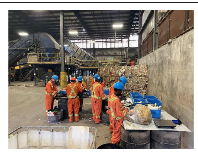
Photo 3: Sorting process of HRM collection Area 1. Photo taken August 30, 2022 during waste audit.