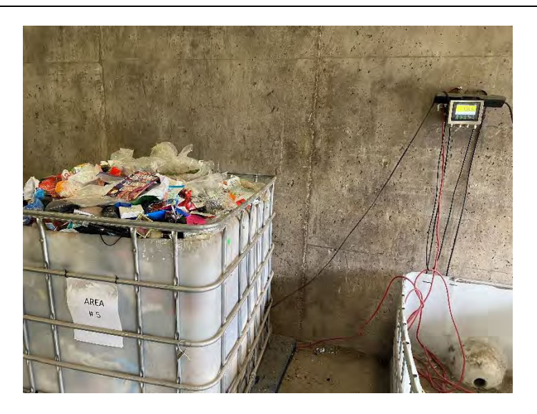
Photo 20: Waste sample from HRM collection Area 5 following sorting. Photo taken August 30, 2022 during waste audit.