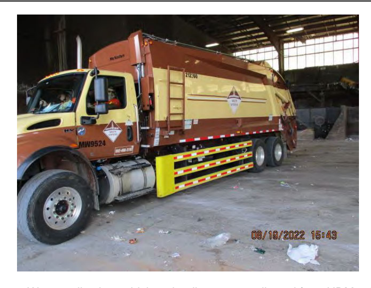
Photo 25: Waste collection vehicle unloading waste collected from HRM collection Area 7. Photo taken on August 19, 2022.