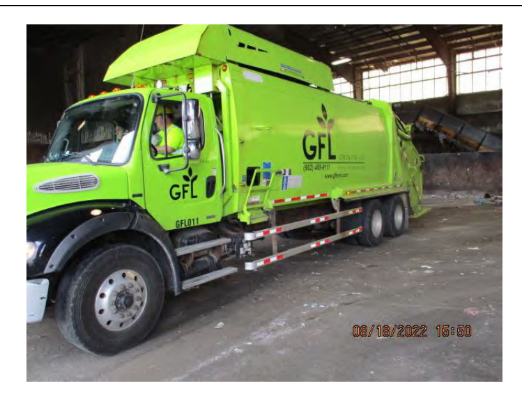
Photo 13: Waste collection vehicle unloading waste collected from HRM collection Area 4. Photo taken on August 18, 2022.