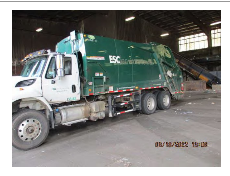
Photo 29: Waste collection vehicle unloading waste collected from HRM collection Area 8. Photo taken on August 28, 2022.