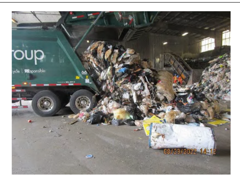
Photo 1: Waste collection vehicle unloading waste collected from HRM collection Area 1. Photo taken on August 23, 2022.