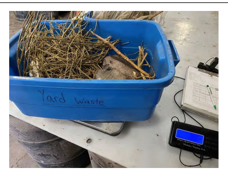
Photo 16: Yard waste bin sorted from HRM collection Area 4. Photo taken August 30, 2022 during waste audit.