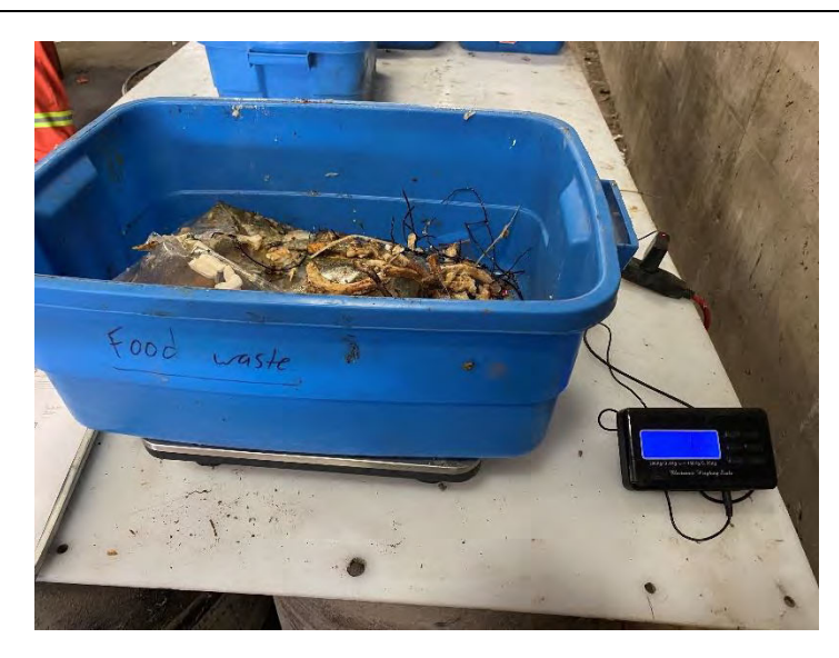
Photo 23: Food waste bin separated from HRM collection Area 6. Photo taken August 30, 2022 during waste audit.