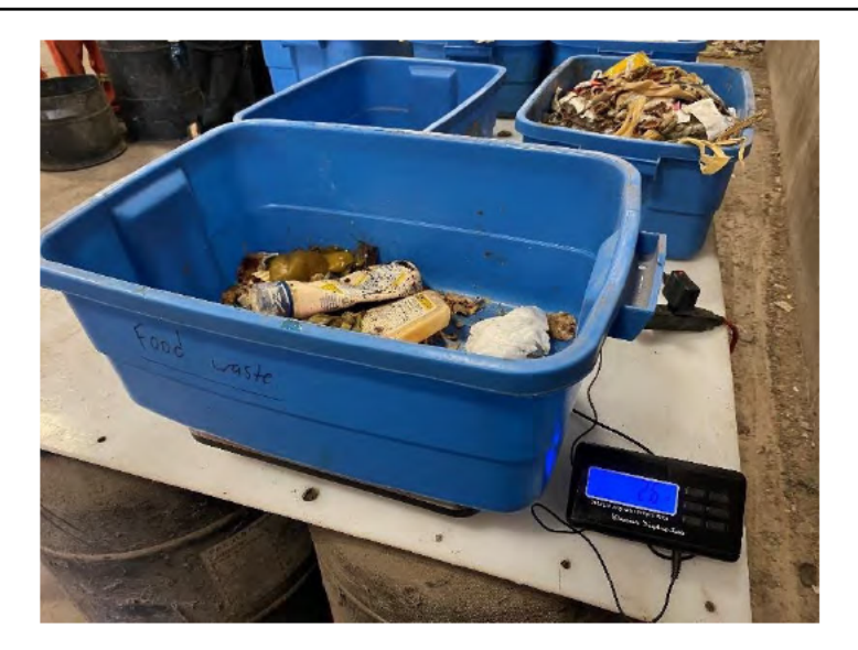
Photo 4: Food waste bin sorted from HRM collection Area 1. Photo taken August 30, 2022 during waste audit.