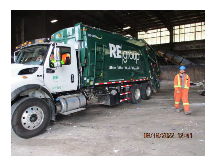
Photo 9: Waste collection vehicle unloading waste collected from HRM collection Area 3. Photo taken on August 19, 2022.