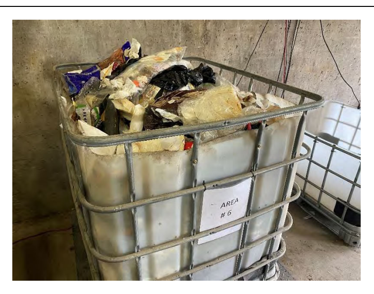
Photo 24: Waste sample from HRM collection Area 6 following sorting. Photo taken August 30, 2022 during waste audit.