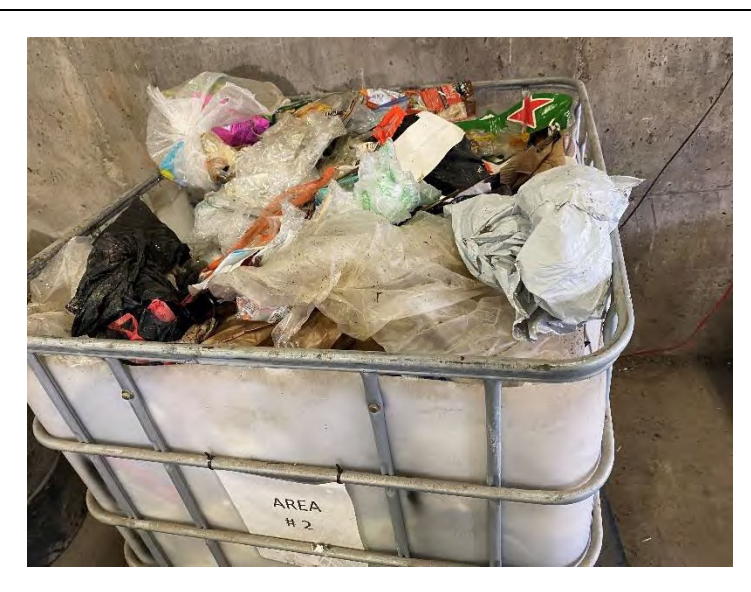
Photo 7: Waste sample collected from HRM collection Area 2 following sorting. Photo taken on August 30, 2022 during waste audit.