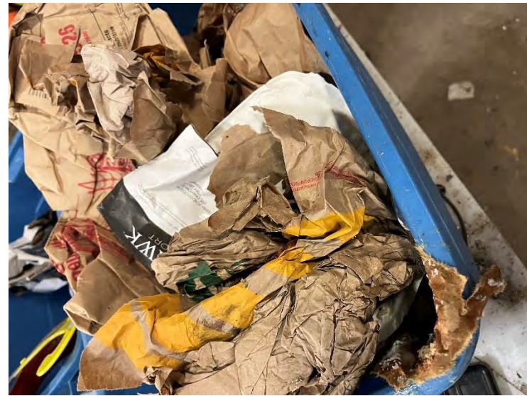
Photo 34: Newsprint/paper waste sample from HRM collection Area 8. Photo taken on November 13, 2024, during waste audit.