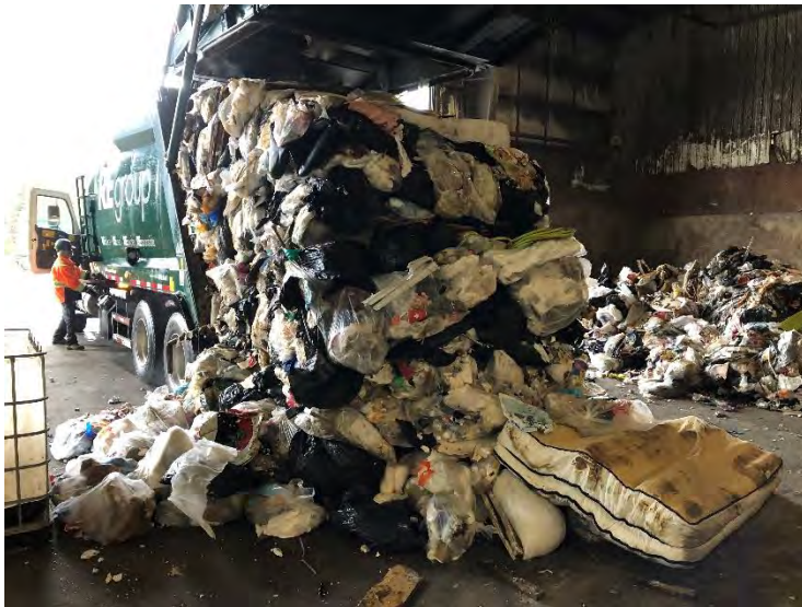
Photo 9: Waste collection pile from HRM collection Area 3A. Photo taken on November 5, 2024.