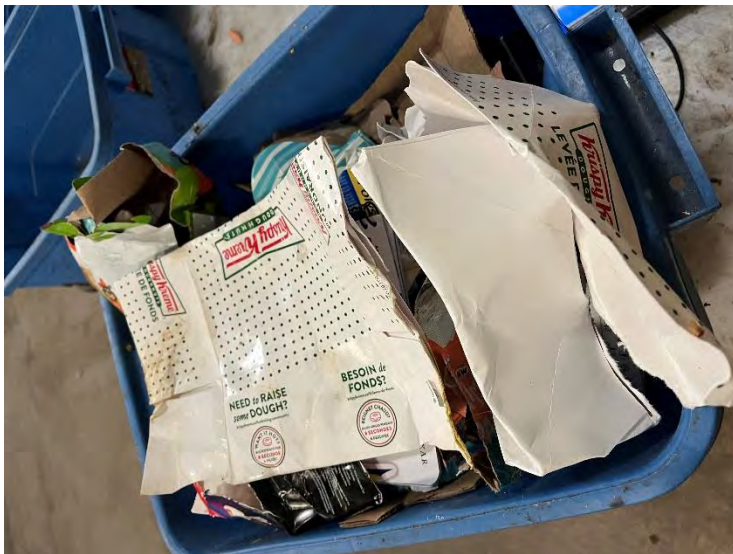
Photo 11: Cardboard waste bin of HRM collection Area 3A. Photo taken on November 13, 2024, during waste audit.