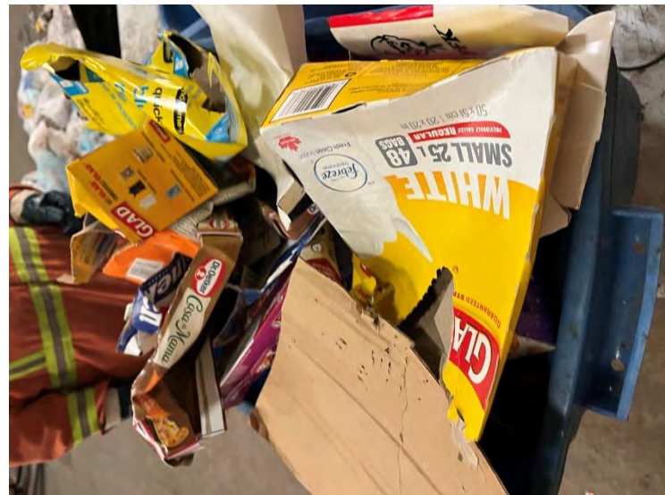
Photo 40: OCC waste sample from HRM collection Area 9 (Condos) following sorting. Photo taken on November 13, 2024, during waste audit.