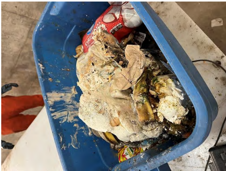
Photo 35: Food waste bin separated from HRM collection Area 8. Photo taken on November 13, 2024, during waste audit.