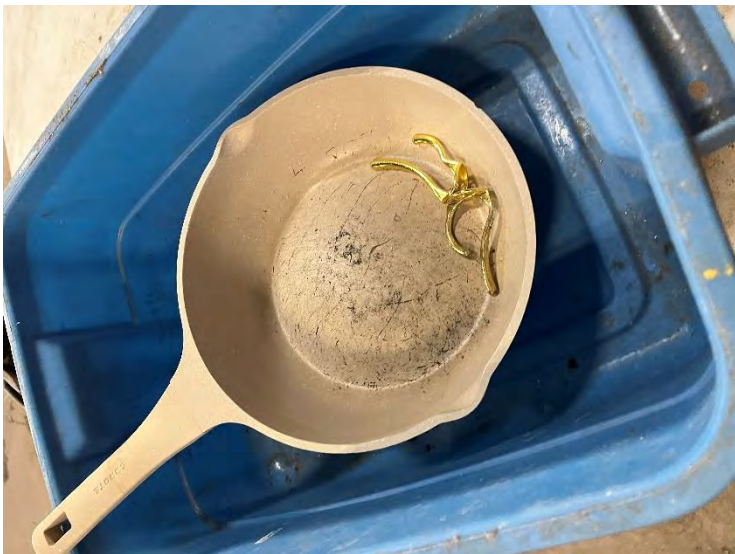
Photo 39: White goods sample from HRM collection Area 9 (Condos) following sorting. Photo taken on November 13, 2024, during waste audit.