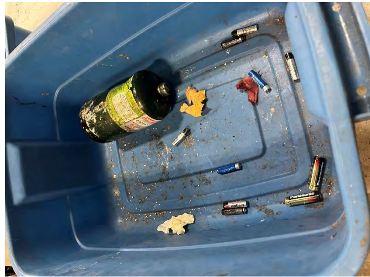
Photo 22: Hazardous waste sample from HRM collection Area 5. Photo taken on November 13, 2024, during waste audit.