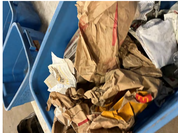
Photo 14: Yard waste sample from HRM collection Area 3B (extra load). Photo taken on November 13, 2024, during waste audit.