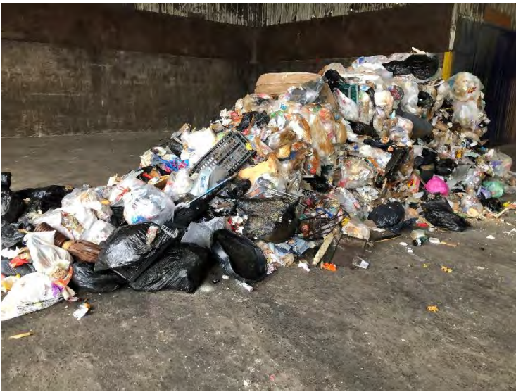
Photo 21: Waste pile HRM collection Area 5. Photo taken on October 31, 2024.