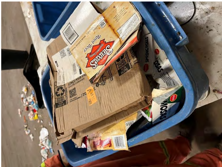
Photo 15: OCC waste bin sorted from HRM collection Area 3B (extra load). Photo taken on November 13, 2024, during waste audit.