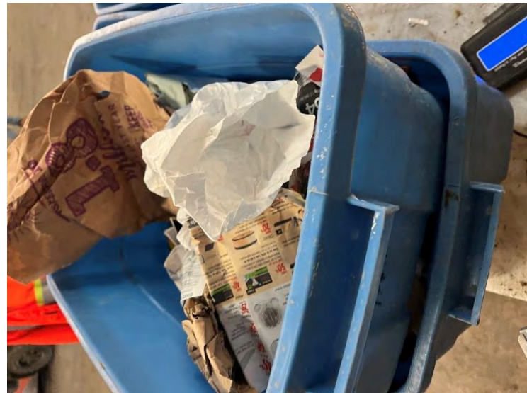
Photo 38: Newsprint/paper sample from HRM collection Area 9 (Condos). Photo taken on November 13, 2024, during waste audit.