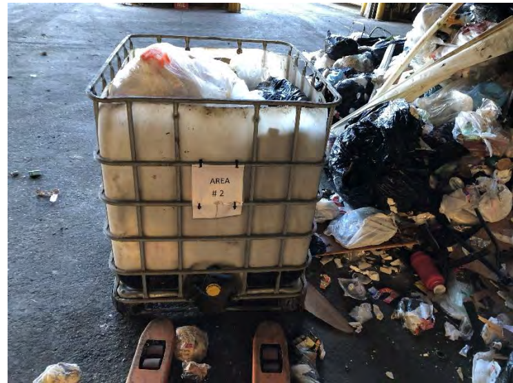
Photo 6: Waste audit sample from HRM collection Area 2. Photo taken on November 4, 2024, during waste audit.