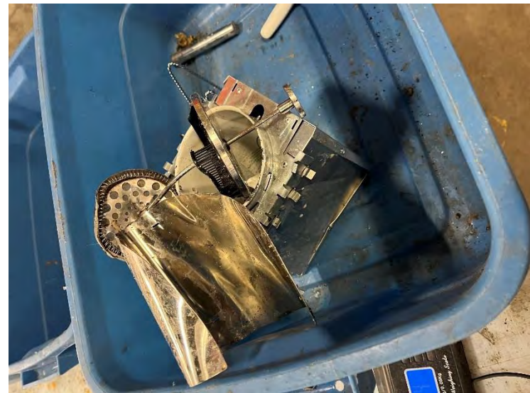
Photo 32: White goods waste bin sample from HRM collection Area 7. Photo taken on November 13, 2024, during waste audit.