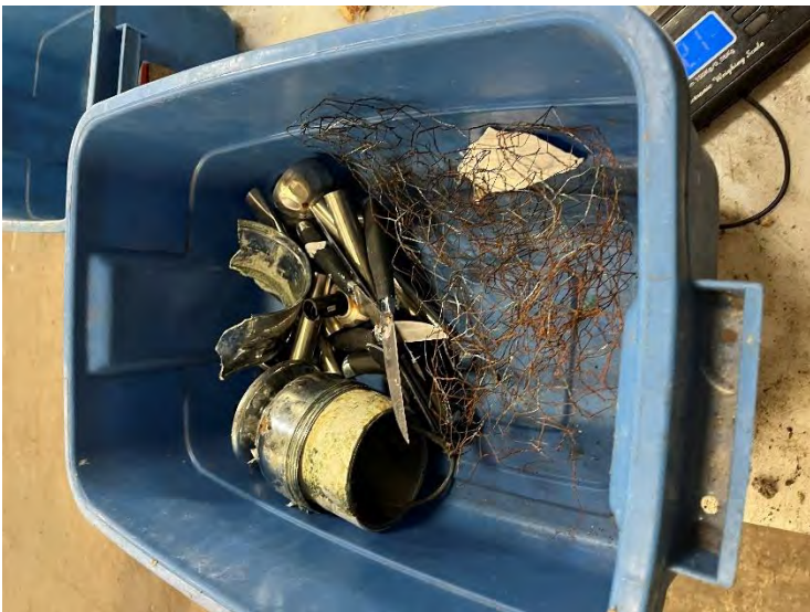
Photo 23: White goods waste bin sorted from HRM collection Area 5. Photo taken on November 13, 2024, during waste audit.