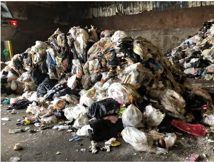
Photo 25: Waste collection pile from HRM Area 6. Photo taken on November 1, 2024.