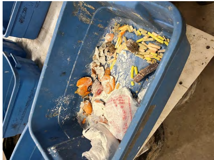
Photo 2: Food waste sample collected from HRM collection Area 1. Photo taken on November 13, 2024, during waste audit.