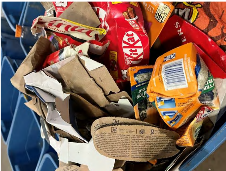
Photo 19: OCC waste sorted from HRM collection Area 4. Photo taken on November 13, 2024, during waste audit.