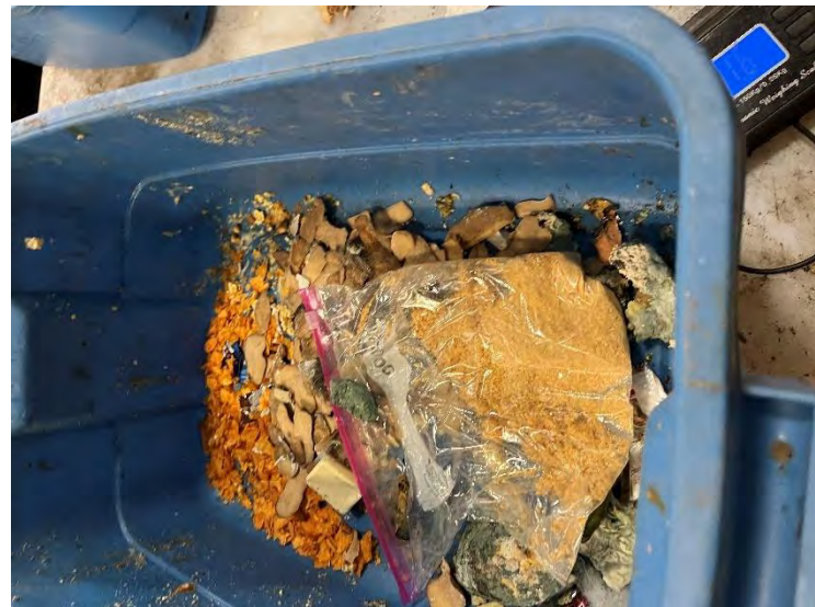
Photo 24: Food waste bin sorted from HRM collection Area 5. Photo taken on November 13, 2024, during waste audit.