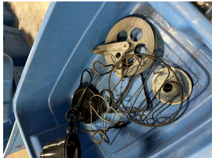
Photo 8: White goods collected from HRM collection Area 2. Photo taken on November 13, 2024, during waste audit.