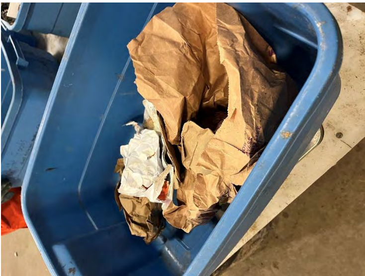
Photo 3: Newsprint/paper waste bin of HRM collection Area 1. Photo taken on November 13, 2024, during waste audit.