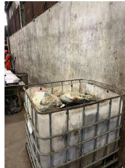
Photo 30: Waste audit sample from HRM collection Area 7. Photo taken on November 13, 2024, during waste audit.