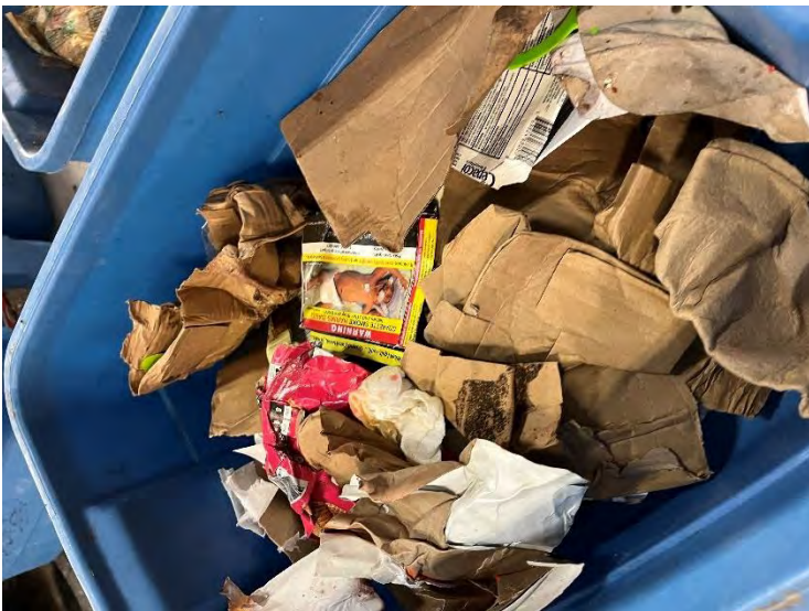
Photo 27: OCC waste bin separated from HRM collection Area 6. Photo taken on November 13, 2024, during waste audit.