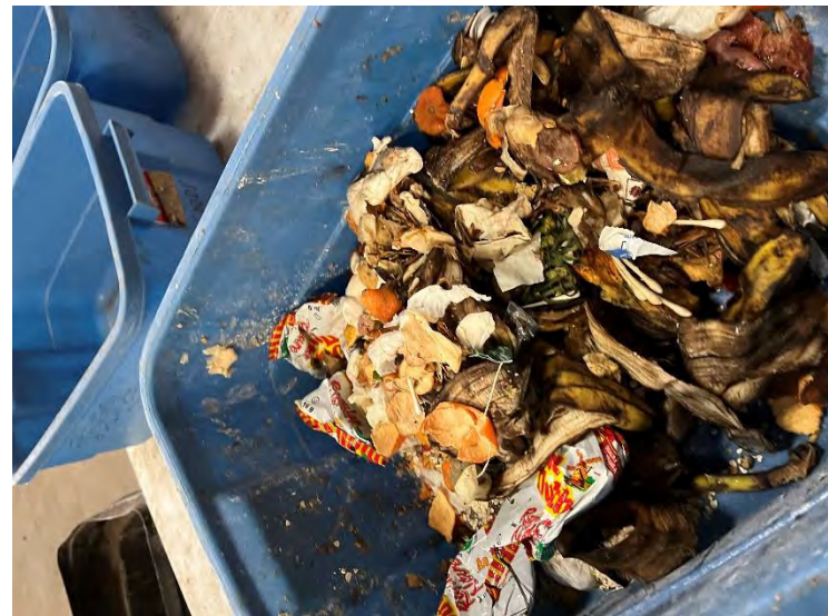
Photo 16: Food waste bin sorted from HRM collection Area 3B (extra load). Photo taken on November 13, 2024, during waste audit.