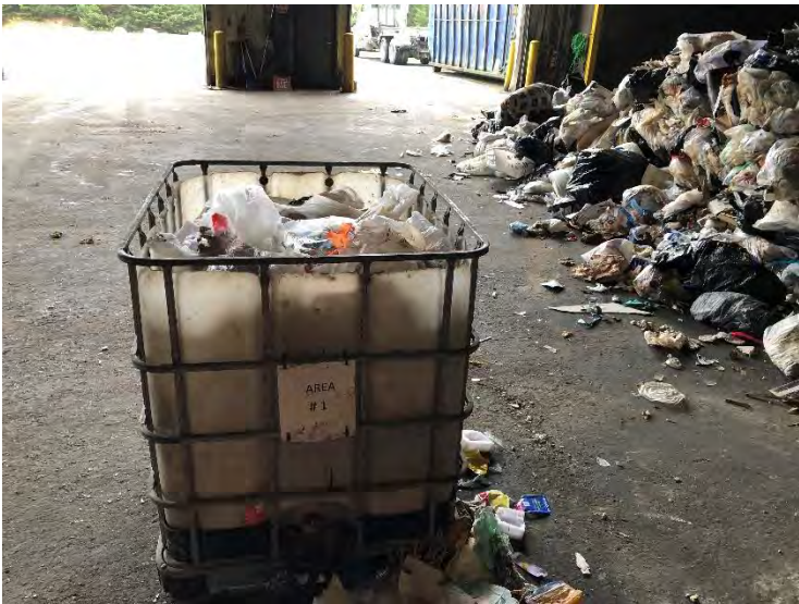
Photo 1: Waste audit sample collected from HRM collection Area 1. Photo taken on November 1, 2024.