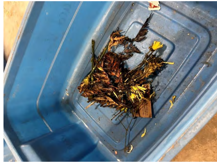
Photo 26: Yard waste bin separated from HRM collection Area 6. Photo taken on November 13, 2024, during waste audit.