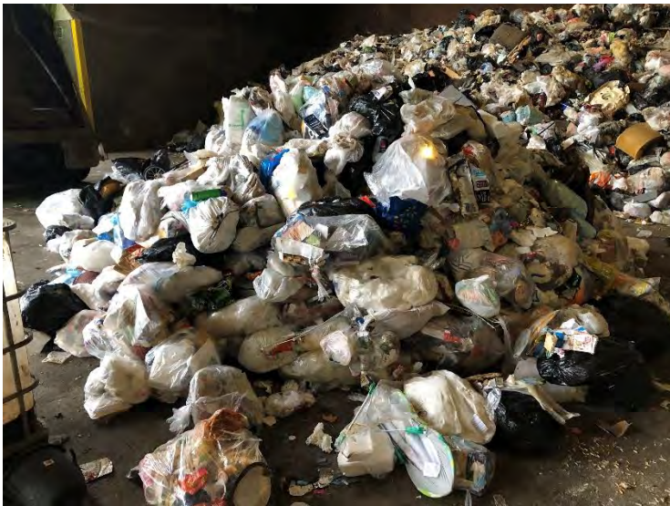
Photo 37: Waste audit sample from HRM collection Area 9 (Condos). Photo taken on November 8, 2024.