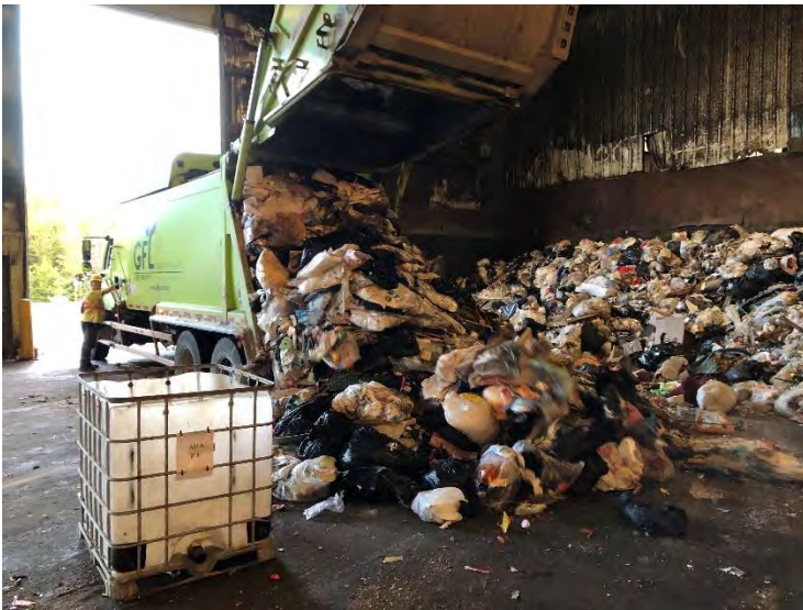
Photo 17: Waste collection vehicle unloading waste collected from HRM Area 4. Photo taken on November 6, 2024.