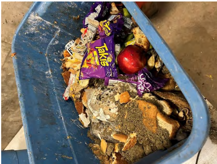
Photo 31: Food waste bin separated from HRM collection Area 7. Photo taken on November 13, 2024, during waste audit.