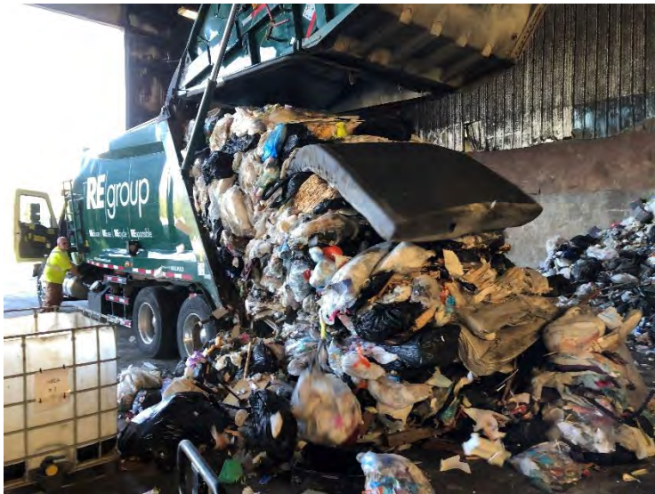
Photo 5: Waste collection vehicle unloading waste collected from HRM Area 2. Photo taken on November 4, 2024.