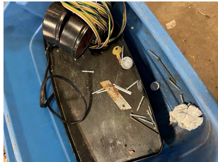
Photo 36: White goods waste sample from HRM collection Area 8 following sorting. Photo taken on November 13, 2024, during waste audit.