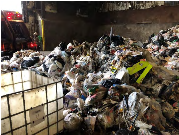
Photo 29: Waste collection pile from HRM Area 7. Photo taken on November 5, 2024.