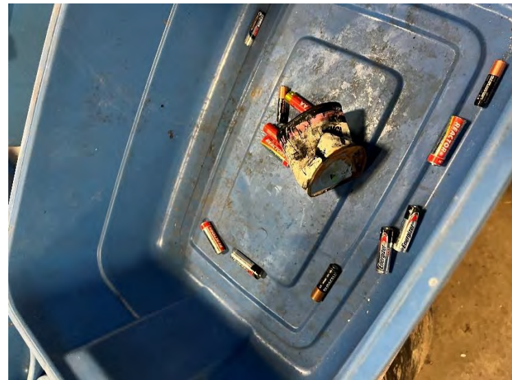
Photo 20: Hazardous waste sorted from HRM collection Area 4. Photo taken on November 13, 2024, during waste audit.