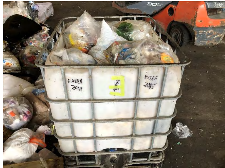
Photo 10: Waste audit sample collected from HRM collection Area 3A. Photo taken on November 5, 2024.