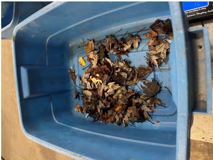
Photo 7: Yard waste collected from HRM collection Area 2. Photo taken on November 13, 2024, during waste audit.