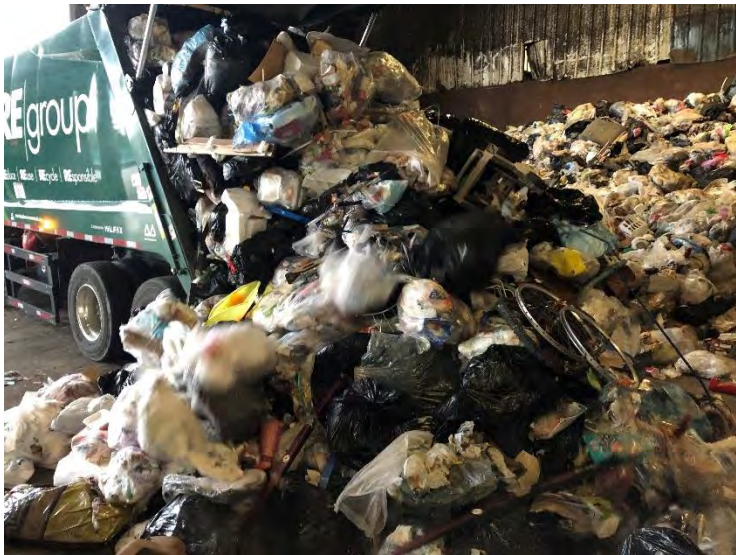
Photo 13: Waste collection vehicle unloading waste collected from HRM Area 3B. Photo collected November 8, 2024.