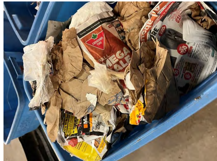
Photo 28: Newsprint/paper waste bin separated from HRM collection Area 6. Photo taken on November 13, 2024, during waste audit.