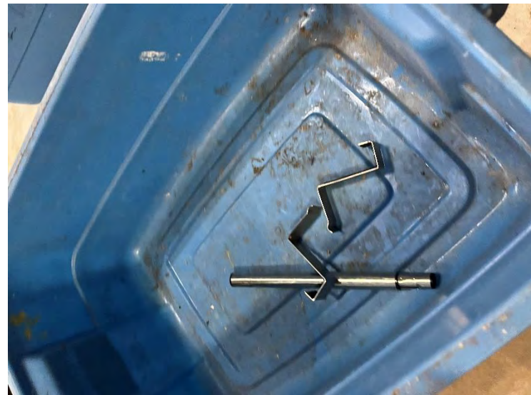
Photo 12: White goods waste bin sorted from HRM collection Area 3A. Photo taken on November 13, 2024, during waste audit.