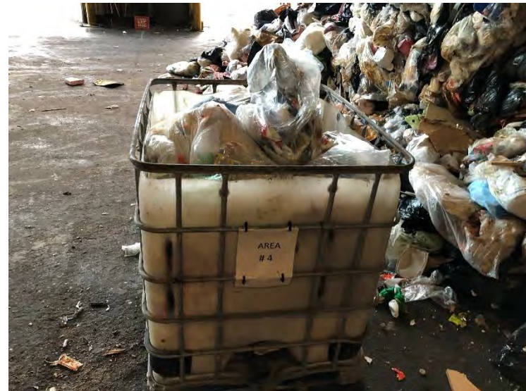
Photo 18: Waste audit sample from HRM collection Area 4. Photo taken on November 6, 2024.